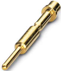
Crimp contact, turned, Single contact, contact diameter: 1 mm, crimp range: 0.06 mm 2 ... 0.25 mm 2

Please be informed that the data shown in this PDF Document is generated from our Online Catalog. Please find the complete data in the user's documentation. Our General Terms of Use for Downloads are valid ( http://phoenixcontact.com/download )